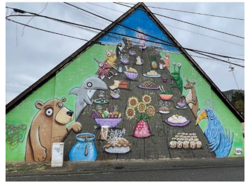
Table of Diversity 2624 Rockefeller Ave Everett, WA 47.9825, -122.2064 24 Hours